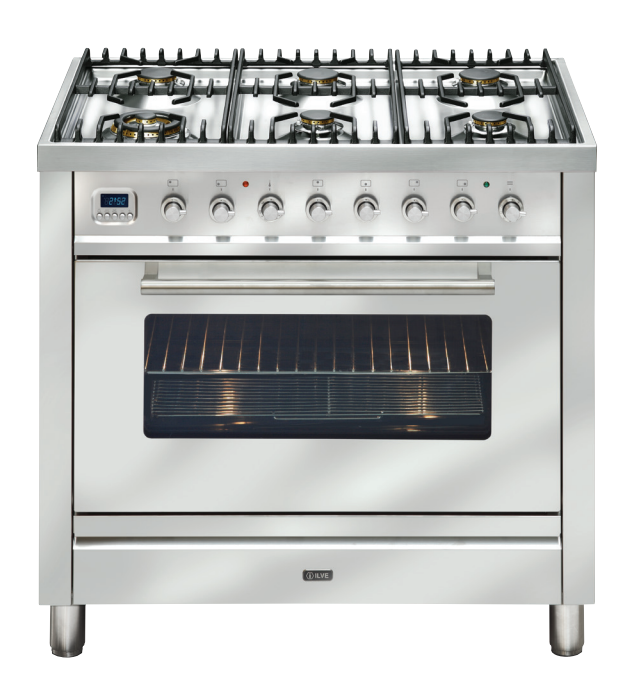
Pictured: NT906WMP/I Cooker in Stainless Steel

ILVE uses our own burner design. Production of the Venturi is horizontal, as used in the professional cookers. The primary air can be adjusted meaning the cooktop can be used with all types of gas. The air:gas ratio is optimised and the flame can be adjusted. This has a great positive impact in lower emission of CO (carbon monoxide) gasses well up to 1/100 compared with the reference standard. ILVE brass burners combine technical precision with performance. Our new Triple ring design guarantees scorching heat is achieved in an instant. Great for Wok cooking, boiling and grilling.