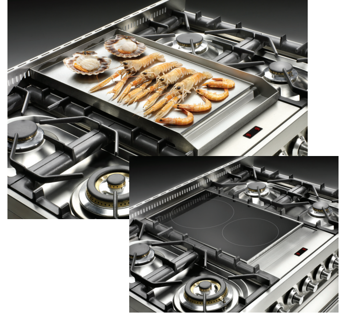
Pictured: Tepanyaki Plate (top), and Induction cooktop that sits below the tepanyaki plate (inset)

Ingeniously combining the latest cook top technology with ILVE's peerless upright ovens, you'll find yourself at a gastro level in no time at all. Italian design and the superior quality synonymous with all ILVE products ensure this is no ordinary kitchen appliance.